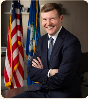
»»» Sean Scanlon State Comptroller @CTComptroller