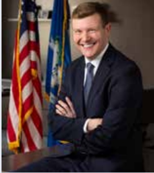
Sean Scanlon State Comptroller