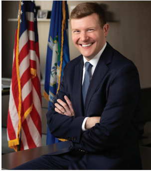
Sean Scanlon State Comptroller @CTComptroller